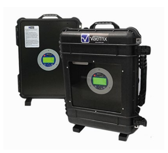
DCR - Chart Recorder Style