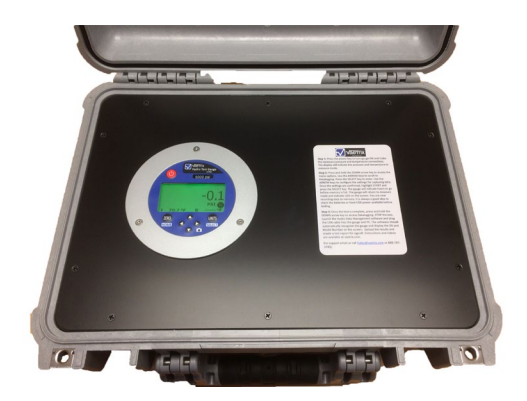
HTGX – Extreme Pelican 1450

Includes: batteries, USB cable, NIST Certificate with Data, and Hydro Test Software *Pick and choose Bluetooth and RTD length options